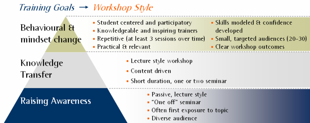
Figure 2: Training goals determine workshop style

The training goal determines the structure, curriculum, target audience as well as the training provider, as described in Figure 3. Further, effective training often combines objectives and incorporates a variety of learning types in order to reinforce the objectives over time.